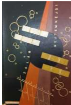
Decorative leather binding of Olbracht. Zalár nejtemnější (1929)