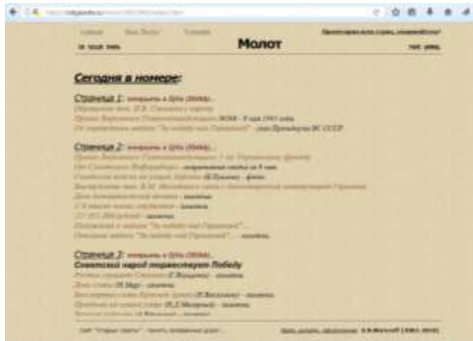
Sample page, here for the newspaper Molot , downloadable page-by-page.