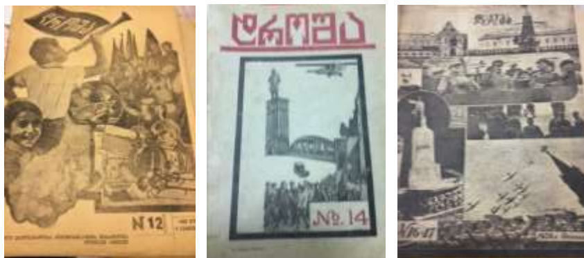
Covers of Drosha .

nine issues of Drosha [ The Flag: Weekly Artistic and Literary Magazine ] დროშა. (Tiflis, 1923-1935).