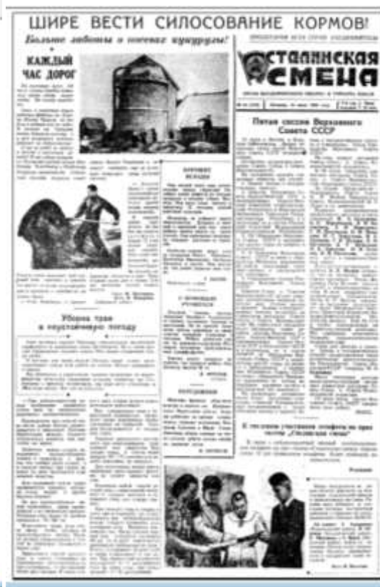
(Left) Sample page of Molot from 1945; (Right) from Stalinskaya smena , 1956.