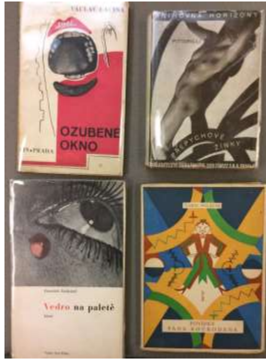
Clockwise from top right: Pitigrilli. Prepychové zinky (1933); Poláček. Povídky Pana Kockodana (1922); Nechvátal. Vedro na paletě (1935); and Lacina, Ozubené okno (1930).

and linoleum-cut endpapers in yellow by Čapek; Pitigrilli's (pseudonym of Dino Segre, 1893-1975) Prepychové zinky [Luxurious ladies] (Praha, 1933) with wrappers incorporating a photograph by František Drtikol (1883-1961);