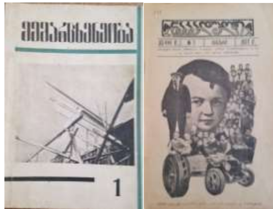
(Left) Memarts'kheneoba (No. 1, 1927), with cover by Irakli Gamrekeli; and (right) Nakaduli (No. 1 1927), with a photomontage by Gustav Klutsis (1895-1938).