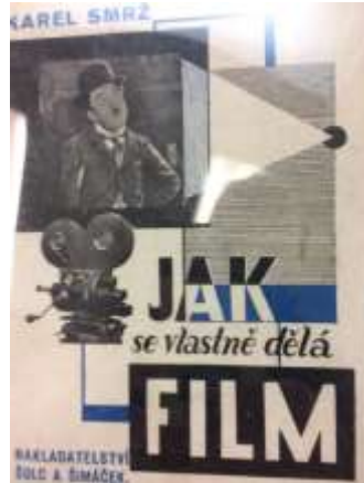
Cover of Smrž. Jak se vlastně dělá Film? (1928).

Film? [How Are Movies Really Made?] (Praha, 1928), with photomontage wrappers and illustrations by Mrkvička. Inscribed on the half-title page by the author.